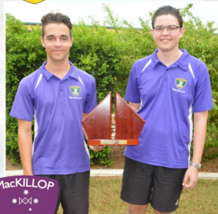
MacKillop - House Spirit

Carnivals like this just don't happen and I would like to take this opportunity to sincerely thank all staff for their enthusiastic and invaluable efforts on the day. We are blessed at Chanel to have such a willing staff who go out of their way to make sure the students have a fun-filled day. Special thanks to the HPE team for coming in early and staying late to set and pack-up the pool, groundsman (for organising equipment and setting up and packing away the grounds) and office staff (who work tirelessly behind the scenes printing, collating names and organizing paperwork) - without your extra efforts, I would not be able to run such a successful carnival.